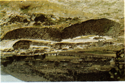
The fortress-temple of Baal-berith, probably the scene of Joshua's covenant (Joshua 9:4f.), was built at Shechem around 1650 B.C. and with modifications continued in use throughout the Period of the Judges.