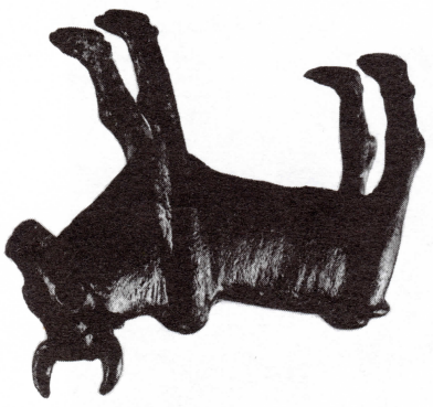
Bronze figurine of a young bull found at a cult center on a hill near Mt. Ebal; circa 1200 B.C.

Mount Tabor, where the forces of Deborah gathered to give battle to the army of Sisera (Judges 4:6f.). A torrent turned the Esdraelon plain in the foreground into a quagmire, rendering Sisera's Canaanite chariots ineffective.